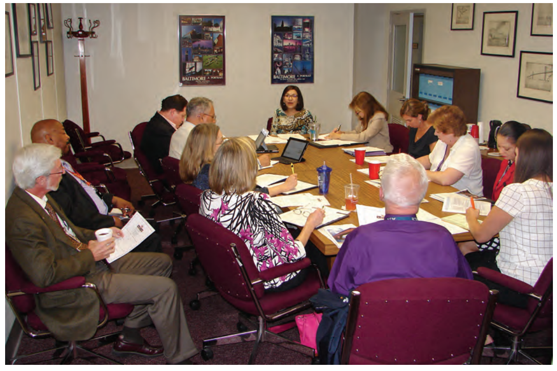
GWIB InterAgency Workforce Meeting

In addition, staff from the Governor's Policy Office frequently attends the InterAgency Workforce Committee meetings.