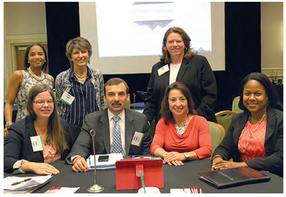
Colorado Workforce Development Council (CWDC), Sector Summit - Denver Marriott Tech Center

During the Summit, leadership from the workforce development, education, economic development communities, along with business partners and other key stakeholders, participated in breakout sessions and interactive panels, designed to provide innovative tools and solutions for developing statespecific, industry-driven sector strategy initiatives.