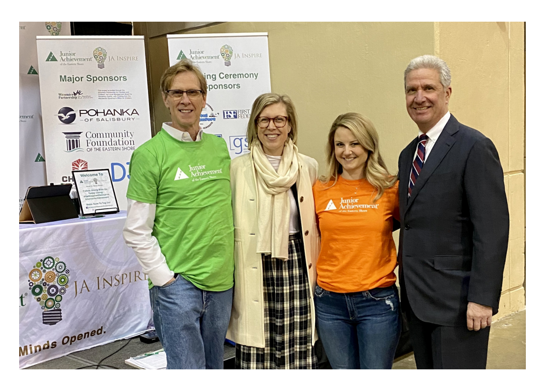
GWDB staff at Junior Achievement of the Eastern Shore Inspire event in February 2020

In June 2020, the U.S. Department of Education issued the Education Stabilization Fund – Reimagine Workforce Preparation Grant , which was a unique opportunity for the GWDB as grants would be made specifically to State Workforce Boards. The GWDB spearheaded a grant application that included a coordinated collaboration with the Maryland State Department of Education Career and College Readiness, University System of Maryland, and Maryland Department of Labor's Division of Workforce Development and Adult Learning. The GWDB developed a grant proposal to create a statewide portal for youth and adults that would guide users in determining a computing education pathway and how to transition into a computing career. This comprehensive online portal would include self-assessments, aptitude assessments, virtual training, virtual mentoring, connections to education pathways, certification pathways, and job opportunities. The grant would have enabled the GWDB to create the portal, create a high school computing program of study, and support over 13,000 adults through a training and certification pathway in both technology adjacent and technology developer occupations. Although the GWDB was not awarded the grant, the GWDB remains committed to continuing the collaboration between industry, education, and government to look for opportunities to rapidly increase access to technology education pathways and ultimately strengthen Maryland's workforce.