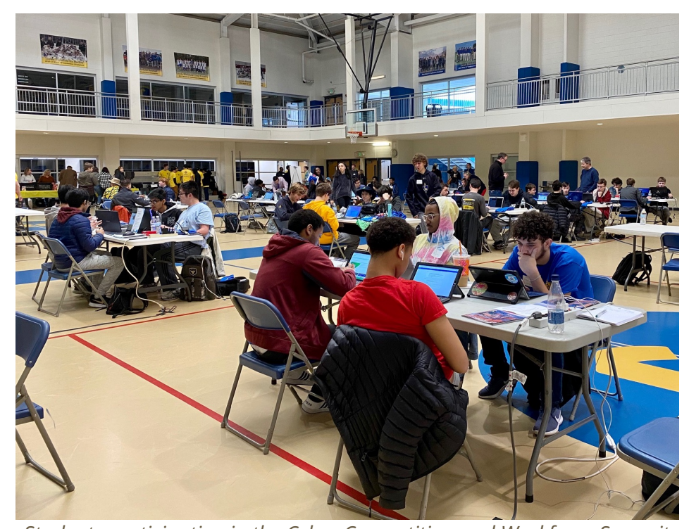
Students participating in the Cyber Competition and Workforce Summit

In accordance with Executive Order 01.01.2017.27, the GWDB developed the Computer Science Education and Professional Development Findings Report , which was delivered to the Governor and members of the Maryland General Assembly in mid-2018. The report addressed how Maryland can more fully develop a workforce that meets the current and future demands of Maryland employers, and provide opportunities for all Marylanders to succeed. The GWDB remains committed to supporting and implementing the key recommendations from the report, which include: 1) hosting and promoting computer science public events; 2) recognizing formal and informal pathways to computer science careers; 3) increasing mentorship and coaching opportunities for youth; 4) increasing access to computer science courses; 5) growing computer science participation and interest among women and minorities; 6) developing a tech extension partnership program; 7) creating a Maryland computer science fellowship program; and 8) increasing awareness among parents and students of the U.S. Government security clearance process. The full report can be found at gwdb.maryland.gov/pub/gwdbcompscirep.pdf.